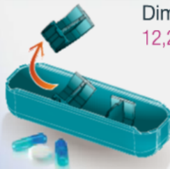
Module with removable separators

■ Extremely compact and chic , its conception and “leather goods” design guarantee complete discretion. Ideal for travel!